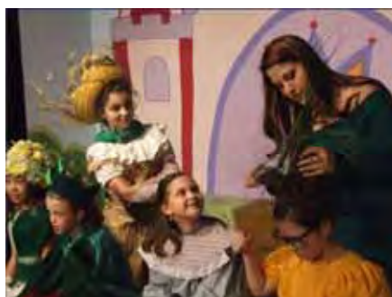
RCT Theatre Camp