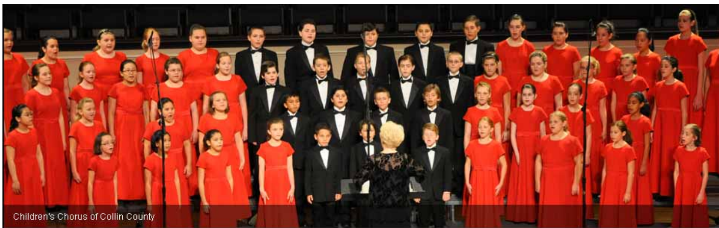
Children's Chorus of Collin County