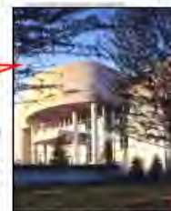
Mesquite Arts Center